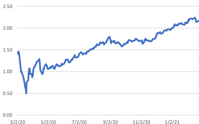
TIPs Breakeven Levels Are Rising (%)

Chairman Jerome Powell has reiterated that the Fed believes that full employment remains well away and that although there could be “some upward pressure on prices” his “expectation is that it will be neither large nor sustained.” 1 Nonetheless, another very large pending stimulus package and prospects for a resurgence in consumer spending as vaccination levels accelerate and normalization slowly returns are giving financial advisors and bond investors reason to pause.