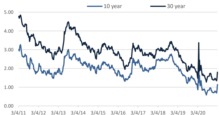
Historical AAA Municipal Yield Curves: March 2011 - March 2021 (%)